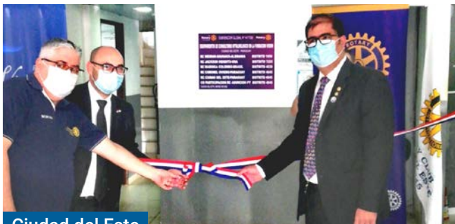
Ciudad del Este

Year 2022 was marked by intense work in our Community Health Clinic. They held four high-impact campaigns in various parts of the country. They operated on a total of 285 persons from Campo 9, Coronel Bogado, Pilar, and Santa Rosa del Aguaray. In the latter location the work was held jointly with Seva Foundation. We keep touring the country, driving blindness away in the most forgotten areas.