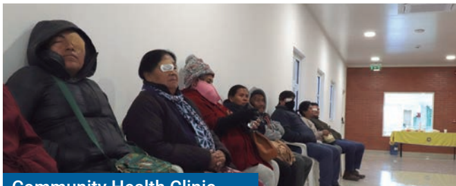
Community Health Clinic

Between May and August two surgery campaigns were held in cooperation with Fundación Panambi, where tens of persons from Chaco and the area, many of them from indigenous populations, were able to recover their vision and their quality of life. Also, the clinic held other three campaigns in the last quarter of 2022. On other matters, the Tonal Audiometry service was opened, and thus this ear health specialized service was made available to this part of the country.